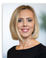
Iva Saicane Value added tax Real estate tax Company car tax