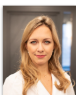
Viktorija Lavrova Taxes on personal income Corporate income tax