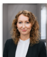
Zane Kornenkova Corporate income tax